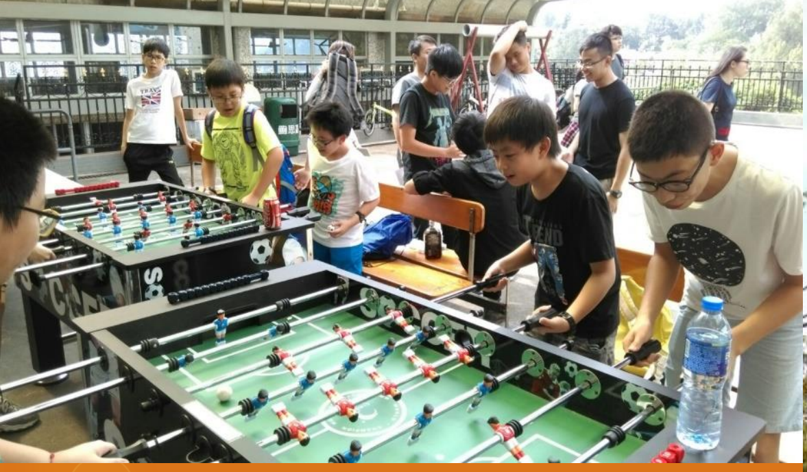
Group games to foster team spirit